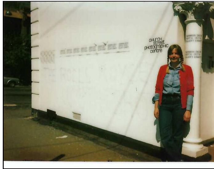
Polaroid image taken outside the Church Street Photographic Gallery

These black and white images of Melbourne's wonderful Queen Victoria Market, taken in July 1978, were among the very first photographs I ever created.